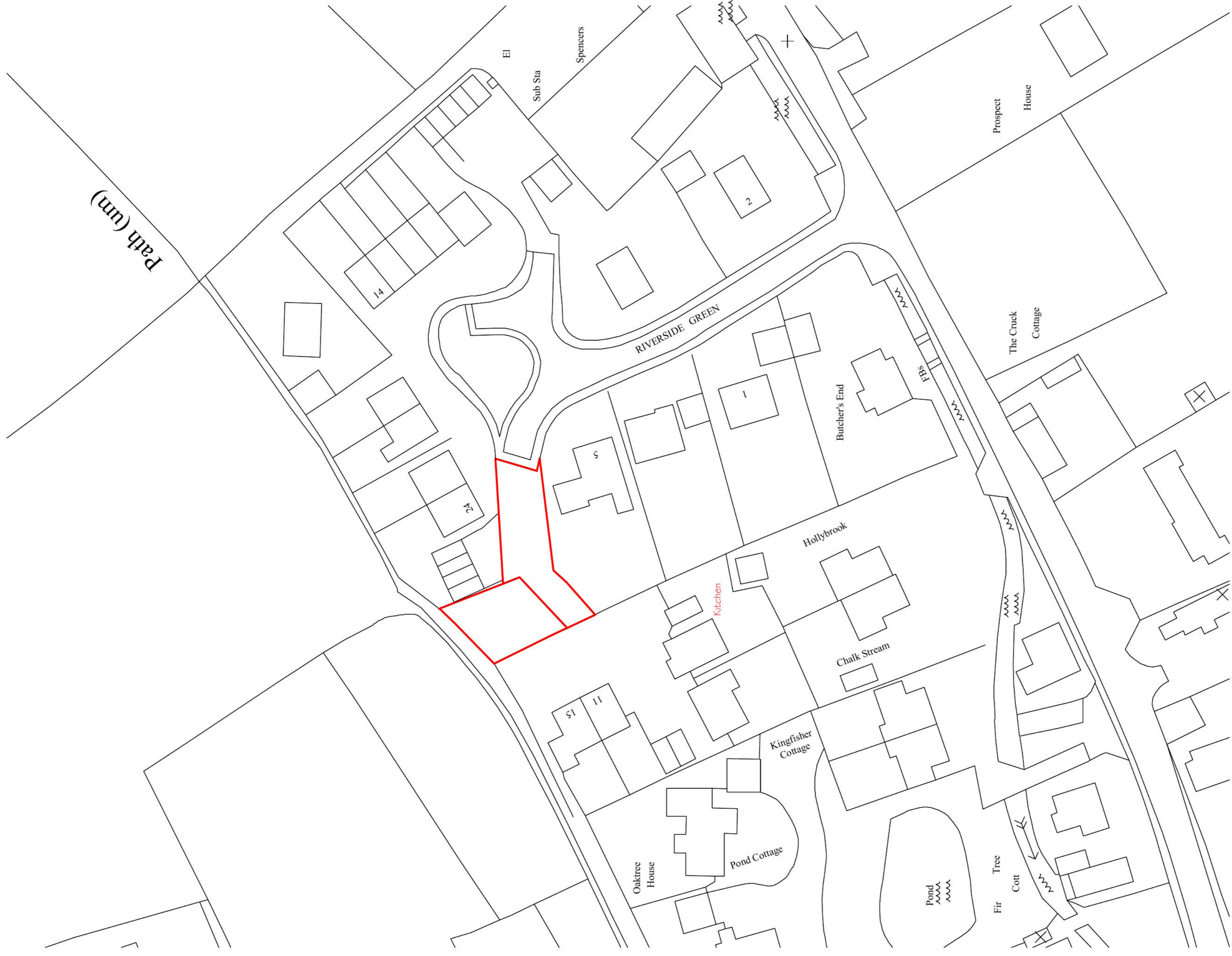
Location Plan 1 : 500